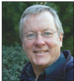
JOHN S. HORTON

Nice 5.9± acres , with scattered timber, nice building site, power to the lot line, septic approval, good access and wildlife abound. $69,500 MLS# 20115603