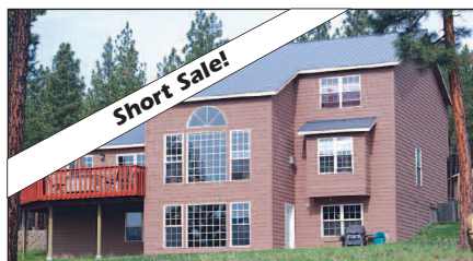
GREAT VALUE! Custom 4697± sq. ft., 5 bed, 4 bath, full fin'd bsmt. w/bar and family rm. On 5.7 acres. Just Reduced! $325,000 MLS# 20111321