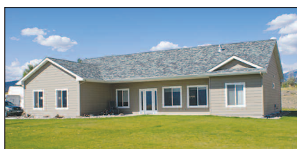
HIGH EFFICIENCY HOME with open floor plan and many upgrades including radiant floor heat. Located only a few miles from town on 5 fenced acres. $300,000 MLS# 20116079