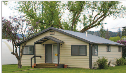
NICE 2 BED 2 BATH HOME with u/g sprinklers, new siding and shop. $99,000 20113624