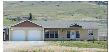
LUXURIOUS ONE LEVEL 3-bdrm, 2.5bath home on 2.47+/- acres, master suite with tile shower, wood stove & new 40x60 shop. Lots of upgrades. $298,000 MLS# 20113446