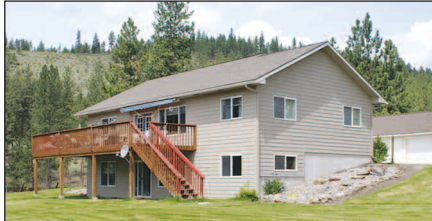
HORSE PROPERTY with beautiful 3 bed 2 bath & walk out basement. U/g sprinklers & paved drive. $299,900 20116314