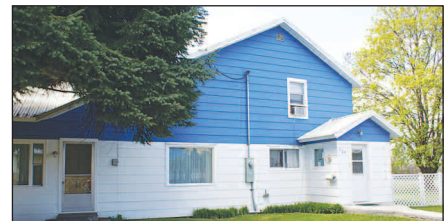
WELL KEPT HOME with large shop, fenced yard and garden area $99,000 20113632