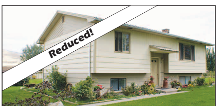
4 BED, 2 BATH HOME on 1 acre with 2 car garage in great neighborhood. Central air & home warranty. Seller is a licensed Real Estate Agent. $160,000 MLS# 20116075