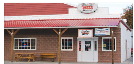
BE YOUR OWN BOSS with a successful pizza business in Plains. Business Opportunity Only building is leased. $75,000 20116887