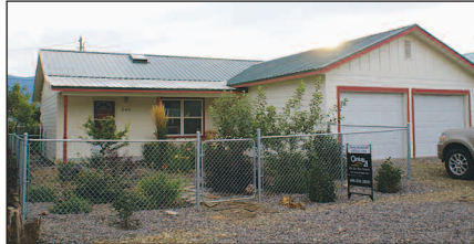
LOW MAINTENANCE HOME - New 3 bed, 2 bath hm w/floor heat. Garden area and no grass to mow. $155,000 MLS# 20116054