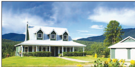
LOCATION, LOCATION! It doesn't get much better than this. Gorgeous two story home bordering conservation wet lands. $249,900 MLS# 20115822