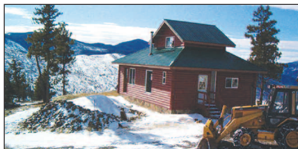
PERFECT HUNTING CABIN OR SUMMER HOME. 18.9± acres w/phenomenal views. $80,000 MLS#20115544