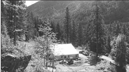
Hunters Paradise!!! 6.5 acres located up scenic Thompson River. 40x50 shop with living quarters, also cabin with a sleeping loft. Exceptional hunting and fishing. $250,000 #1017

If you are buying or selling you can trust Montana Riverside Realty to handle all your real estate needs. With a vast knowledge of the local market you can expect superior customer service!