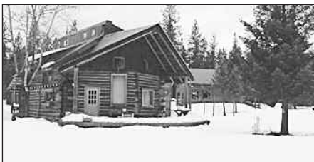
Rustic Log Home in the beautiful Bull River Valley. This 4 bdrm home is located on 14+ ac. Property has spectacular views in every direction with an abundance of wildlife. NF border to include scenic nature walks to the gorgeous Bull River. Beautiful tree mixture & gardens. Also 24x32 shop & more! Agent is related to seller. Price Reduced. $360,000 #1014