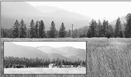
Salish Shores III Lot 10 & 11- Great secondary water access lot! Septic approval, paved roads, water and private boat launch access. Price includes standard septic installation and water hook up! Lot 10 1.09 acres. Lot 11 1.24 acres. Agent Owned. $47,000 each. Seller Financing. #1001 & #1002