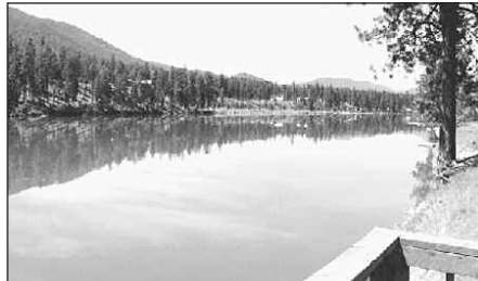
River Access Lot! Scenic river views from this treed lot. Located off of the navigable Clark Fork River! Parcel has a deck that overhangs the river bank. Water and septic system installed! This is an excellent price for the lot and improvements! Ready for your RV or your waterside dream home. $140,000 #1016