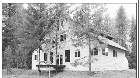
NEW LISTING! Private Setting!! Spacious home on 20 acres. Large picture windows, exposed beams and full upper level master suite. This home is partially finished and just needs your finishing touches. Great well, power and septic system. This is an excellent value for all the improvements!! $239,000 #1020