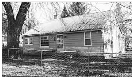
Cozy house in beautiful Thompson Falls. Great starter home or investment property. 1102 square foot home located on 3 corner lots. Excellent location between elementary and high school. Priced to sell at $84,000. #1008