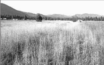
Spectacular Mountain Views! Watch the airplanes fly in and land from the small airport nearby! This 3.98 acre parcel has paved roads, power near, standard septic and water to be hooked up by sellers. Seller Financing. This is a great buy! $67,500 #1009