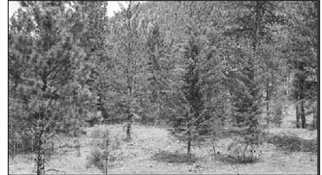
Excellent Location! Treed, 6.2 acres North of Town. Paved roads, septic approval, great well area and power is near. Great location for your dream home. Broker is related to the seller. $80,000 #1015