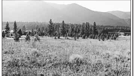
Salish Shores III Lot 22 - Exceptional secondary water access lot! Scenic views from the bluff. This 1.03 acre property is sloped for great daylight basement options. Septic approval, paved roads, water to be hooked up by buyer. Private boat launch access. Great proximity to town and schools. $75,000 #1003