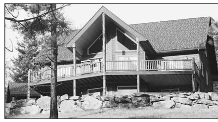
Majestic Montana Home! Exceptional floor plan for this 6 bdrm cedar home. Hrdwd floors, hickory cabinets and vaulted pine ceilings. Daylight bsmt with rec room and patio leading to private outdoor hot tub area. Amazing mtn. views from deck! 7.98 landscaped acres w/large retaining rock wall, fire pit and sprinkler system. Garage & shop. Agent Owned. $625,000 #1007