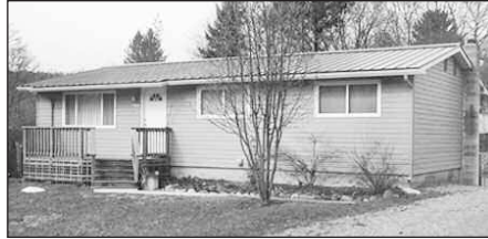
Fabulous Home In Town!! 3 bdrm home with full walk-out basement. Efficient upgrades that include steel insulated siding, vinyl windows and new appliances! Also new paint and gutters. Wonderful location by park and scenic dam site. Beautiful landscaping with rock wall. $175,000 #1013