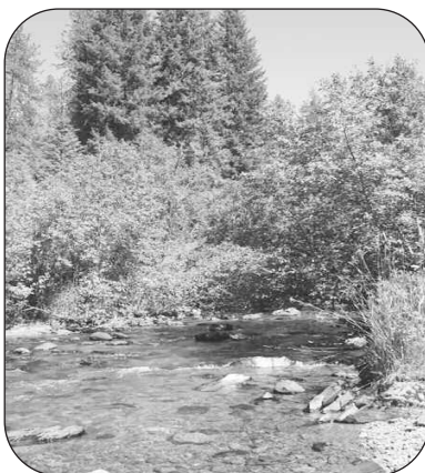
4 Acre Creek Front Starting at $109,000