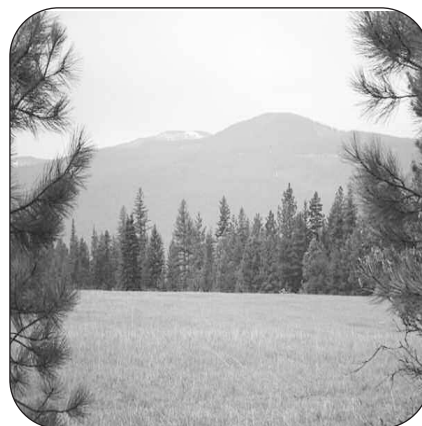
2+ Acre Parcels Starting at $59,000

*Note: All information is from sources deemed reliable, but is not guaranteed by Montana Paradise Realty, LLC or its agents. We urge independent verification of each and every item submitted to the satisfaction of any prospective purchaser.