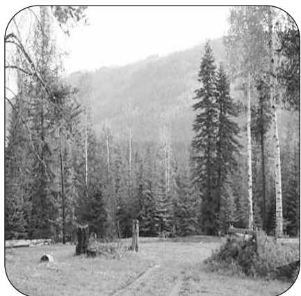
4 to 5 Acre Parcels Starting at $89,000

TIMBER MEADOWS -- offers awesome mountain views, aspen meadows and winding drives to your own quiet home site. Listen to the sound of the creek, watch deer, elk and wild turkeys from your porch, walk to the pristine Noxon Reservoir for fishing and swimming. Perfect for horses. The ideal property for your dream home or your own private camping spot. Utilities are close to each parcel and all have septic approval. Some already have wells (well depths in the area are only 120' to 160' deep). See more information below on the types of lots available. You may also Visit our Website for more photos & plat maps of Timber Meadows: www.montanaparadiserealty.com "