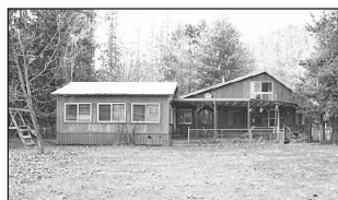
Vermillion Point 2 +/- acres w/4 Bed, 2 Bath home, Avista access, many out-bldgs. $548,000 (0000)