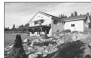
3744 sq. ft. Home on River, 1.45+/- acres, 3 Bed, 2 Bath. $629,500 (2028)