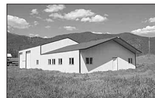
3600 sq. ft. Commercial Building on 1+/- acre. $149,900 (1692)