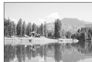
5 Bed, 2 1/2 bath on Noxon Reservoir, Avista access. $599,000 (0000)