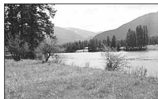
1.1+/- acre River Property on Salish Shores. $175,000 (2003)