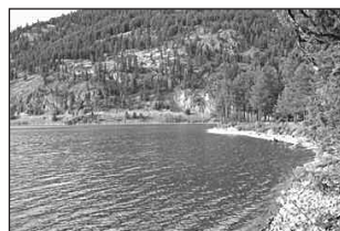
2+/- acre River Property, power, septic and water already in. $249,000 (2057)