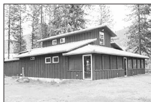
2 Bed, 2 Bath home on Noxon Reservoir, Avista access. $398,000 (0000)