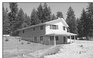
4 Bedroom 2.75 Bath on 6+/- acres, Big Shop! $349,000 (1926)