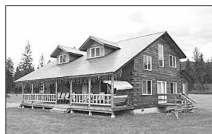
Log Home on 7+/- acres, 3 Bed, 2 Bath, 360 degree views. $449,500 (2019)