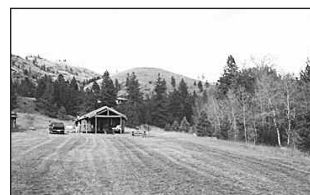
Cabin on Henry Creek, 20+/- acres, Great Privacy. $149,900 (1909)