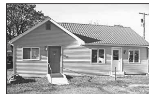
Commercial Bldg, 2 office spaces. Downtown T-Falls. $139,900 (2094)