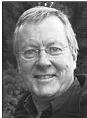
JOHN S. HORTON

These 2 parcels have been selectively logged to provide great building sites in a park like setting, yet only minutes to Thompson Falls. Lots of matures trees and wildlife to enjoy. Septic approval and Wells are in and tested at 30 gpm. Lot 17 - 6 +/- Acres $115,000 MLS #901068 Lot 18 - 6 +/- Acres $115,000 MLS #901072